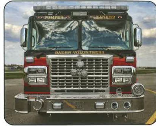
Front Bumper Suction/Discharge