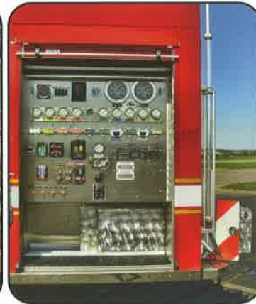
Rear Mount Pump