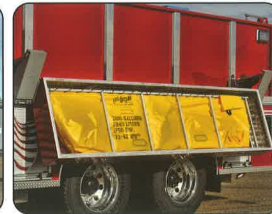
Drop-Down Portable Tank Storage