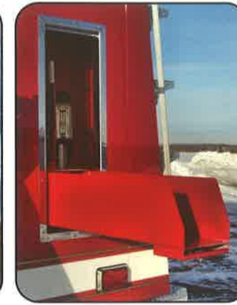
Drop-Down Dump Chutes