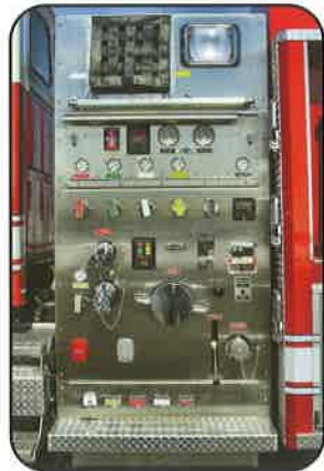
Side Pump Controls