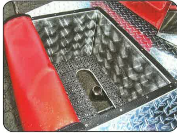
Front Bumper Hosewell