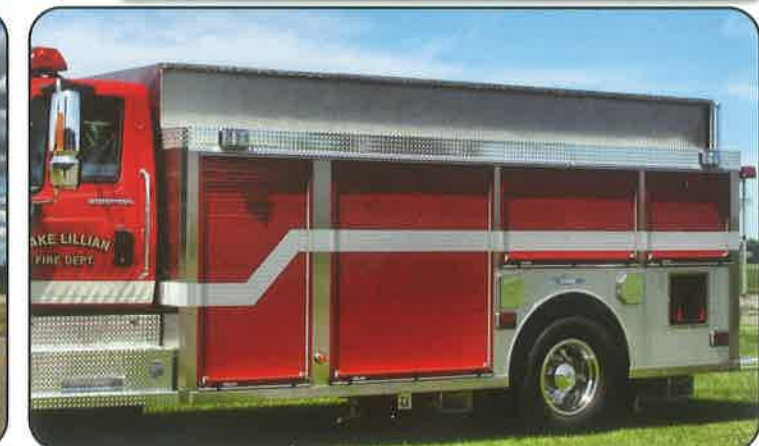
Compartmented Tanker Body