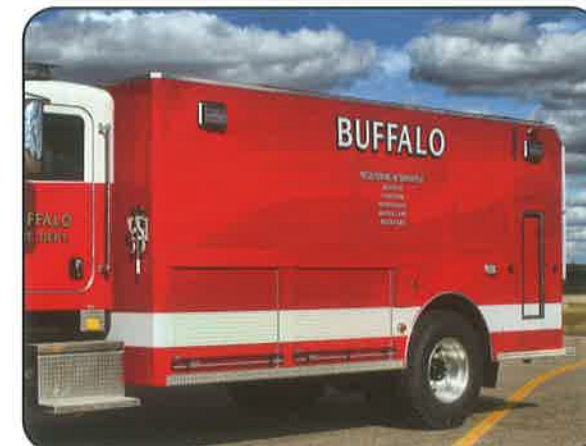
Dry Side Tanker Body