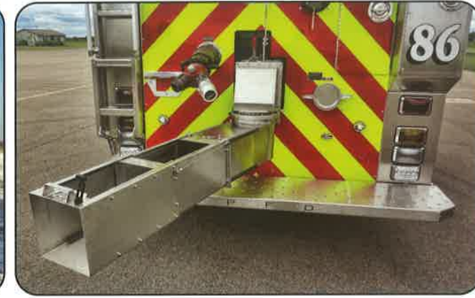
Manual Dump Chute Extension