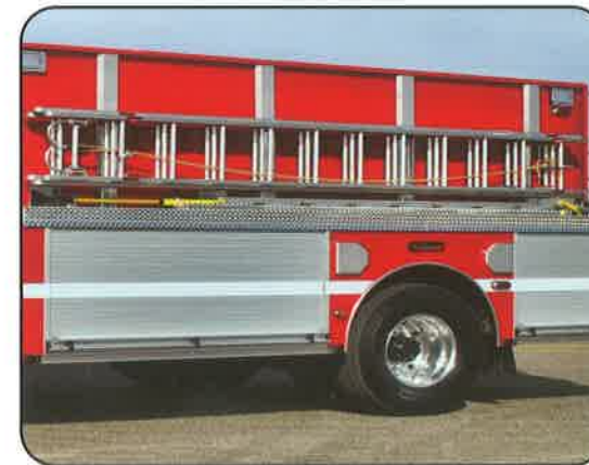
Recessed Ladder Storage