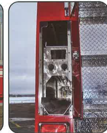
Slide-In Suction Hose Storage