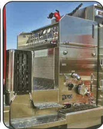
Top Pump Controls