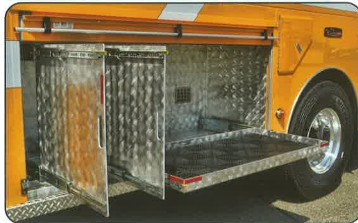
Pull-Out Trays and Tool Boards